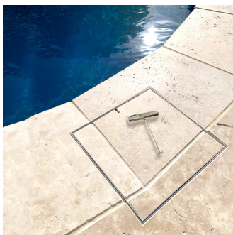
SKIMMER BOX COVERS