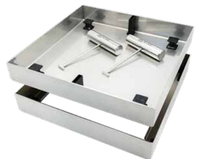
Polished or Exposed Concrete