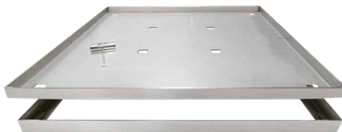
656 High-flow Drain