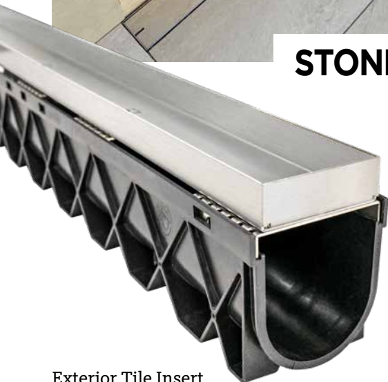
Exterior Tile Insert