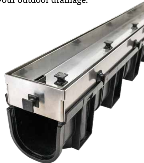
Exterior Concrete Infill