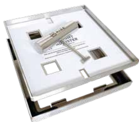
206 Access (Available in Polymer)