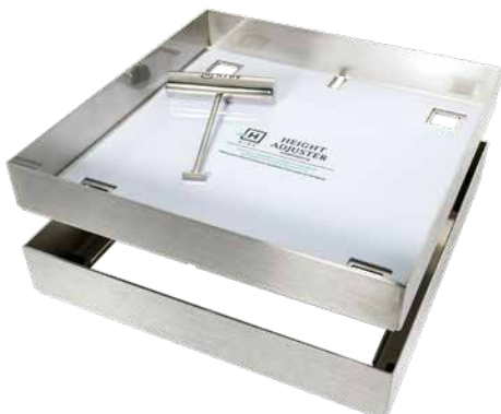
342 Access/Skimmer Lid (Available in Polymer)

Safety is paramount, and with HIDE, you can rest assured. The lid has a unique safety key, preventing unauthorized access. This feature provides secure entry and adheres to Australian pool regulations, ensuring your peace of mind.