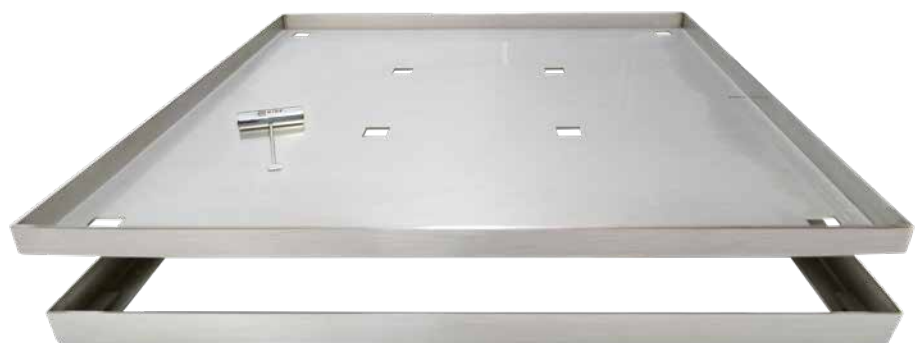
506 or 656 Access/Manhole Cover